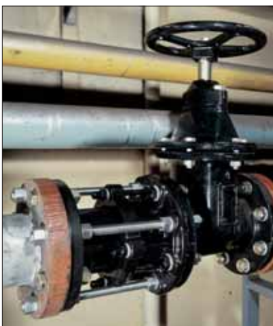
DN100/4" Dismantling Joint in plant room application.