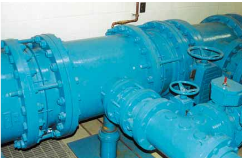
Crown WTP, Cleveland, Ohio, US

Typical Dismantling Joint applications include: pumping stations, water treatment works, sewage treatment works, plant rooms, meter chambers, power generation equipment and gas distribution stations.